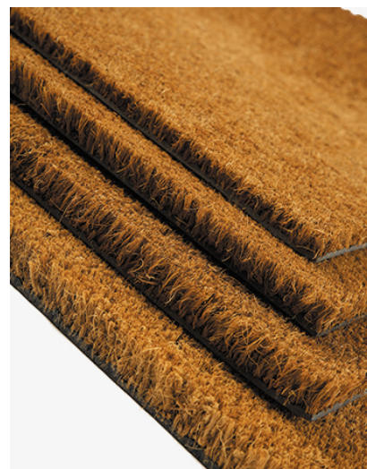
Pile Depth Options

Note: Coir floor coverings are not produced in robotic factories. They are the products of agriculture, using natural dyes. Minor irregularities in weave are inherent to these products – they do not affect wear. They are not flaws. Colour variations are also common – from roll to roll, from sample to roll and even within roll.