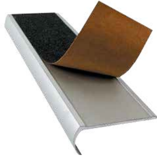
Bullnose Stair Nosings