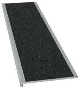
Slimline Stair Nosings

Our manufacturing standard lead time is up to 10 working days plus delivery time.